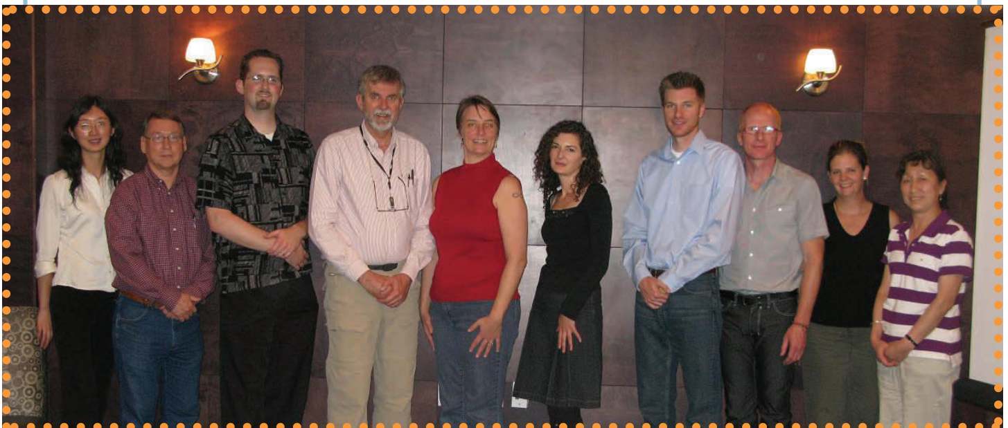
The PNAIRP Executive Committee at the 2010 Conference, Vancouver, B.C. Canada

PNAIRP 2011 Proposal submission guidelines are available at our website: http://www.pnairp.org/conferences/index.asp